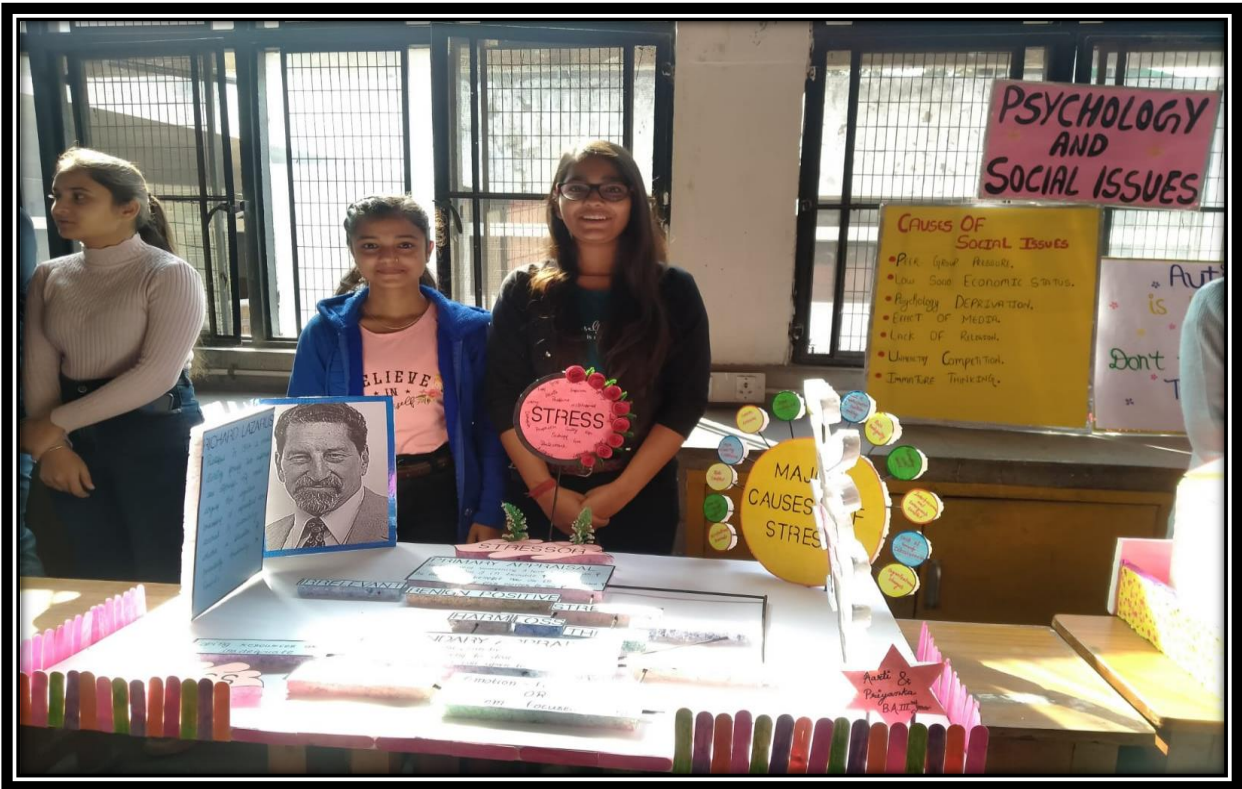
Community Service: Raising Awareness outside the College Campus